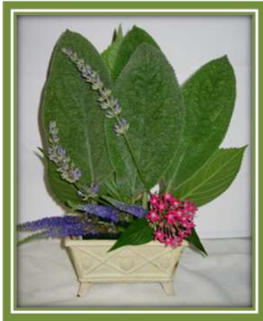
Duo Design created by Bev